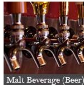
Malt Beverage (Beer)