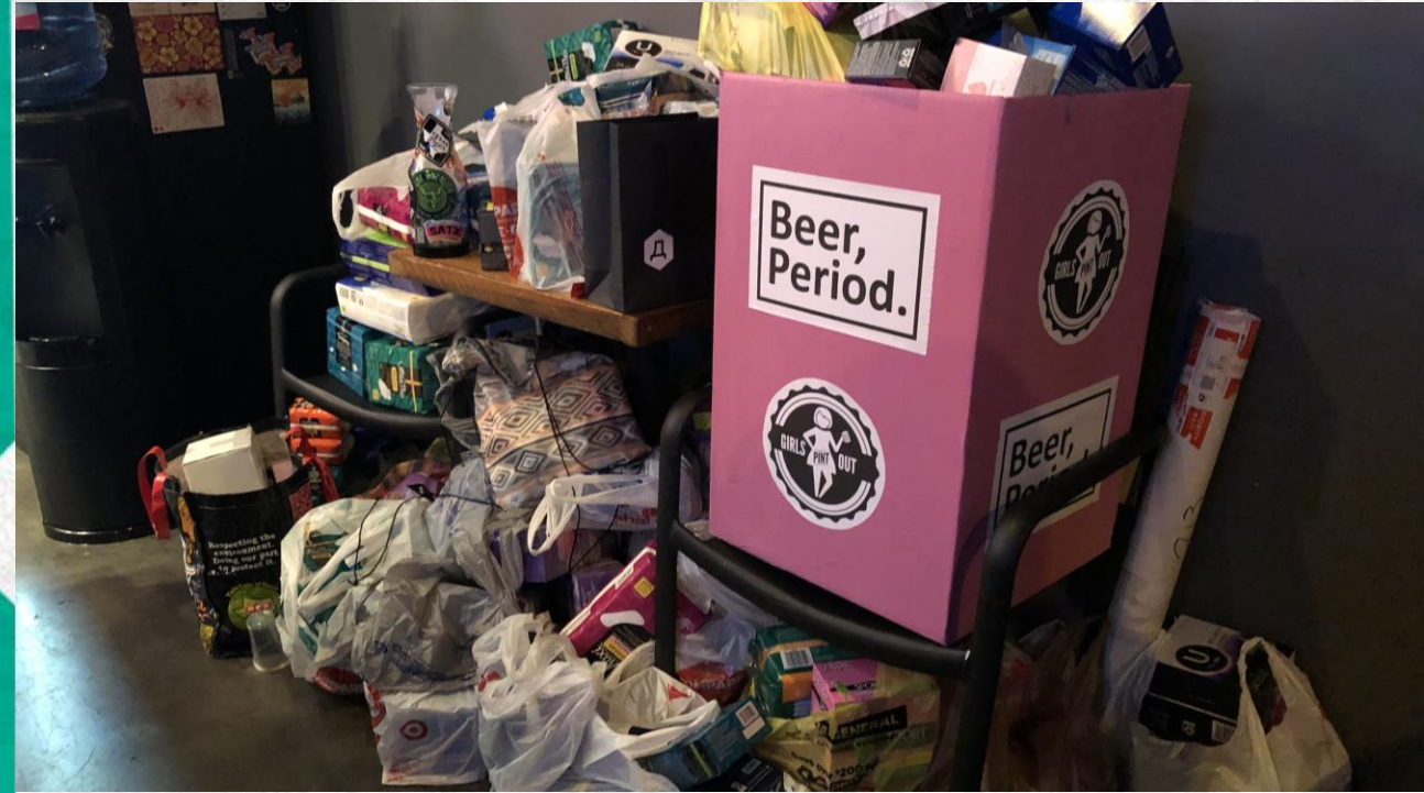
Beer, Period. Girls Pint Out